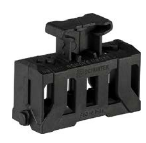
ESO_10.3x38 Fuse Inserter/Extractor with Cover Function for 10.3x38 mm Fuses in Clips