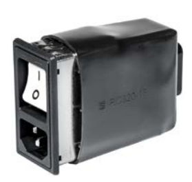
RC320 Rear Cover for Power Entry Module