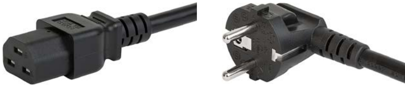
Power plug EU black